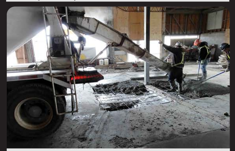
Pouring cement to finish the footings.