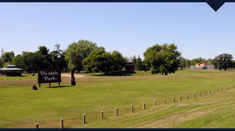
The effects are evident a year later as many of the trees were unable to tolerate all the water.

Queen Elizabeth Park is low lying and barely withstood the water mother-nature inundated it with.