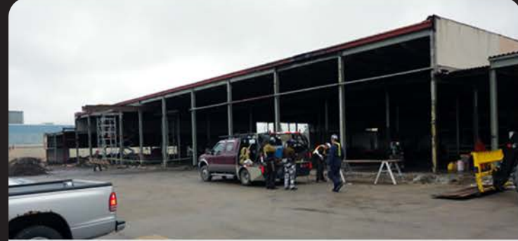
The building with the front removed before installation of a new front.

The new headquarters of the Brandon Police Service will incorporate many new design elements that will change the way police services are delivered in the City of Brandon. This includes a large Identification Unit with a state of the art laboratory, consolidating clerks in one area to create efficiencies and housing all detectives in one area.