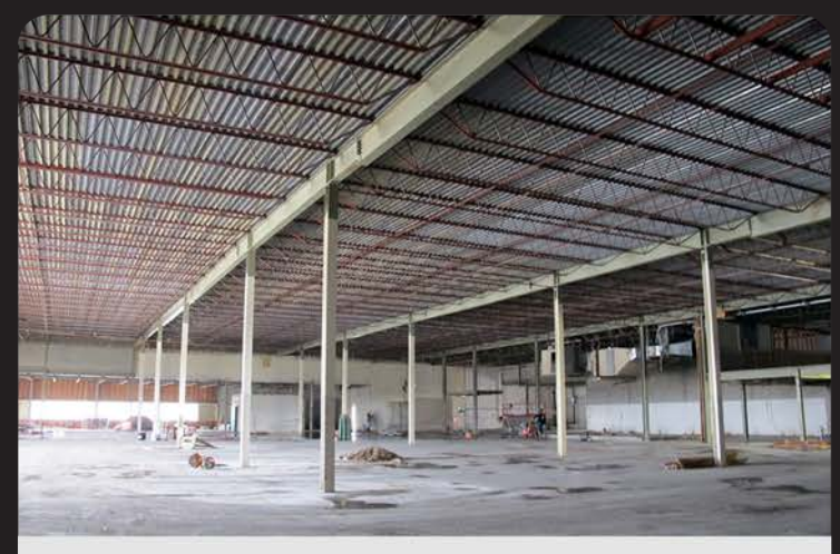
DID YOU KNOW?

The square footage of the building more than doubled in size from 18,000 square feet to 42,000 square feet. There is 90,000 feet of computer cable installed in the new building that's over 17 miles!