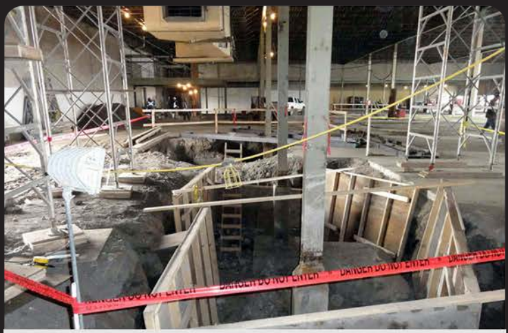
Reinforced footings to strengthen support columns to hold the reinforced roof.