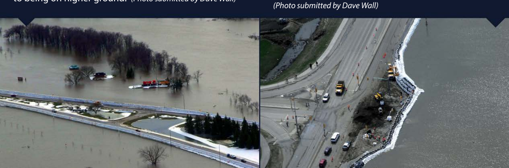
The banks of the Assiniboine River extended to 1st Street. The train display in Dinsdale Park was saved due to being on higher ground.

from breaching the more than 10 foot high wall.