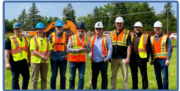
Ground breaking ceremony for the new John Howard Society transitional housing being built at 353-16th Street North.

More information about the incentive can be found at https://housingincentive.brandon.ca/ . The other incentive updates an existing affordable housing by-law to include transitional and supportive housing. This updated affordable housing incentive is currently being researched and developed.