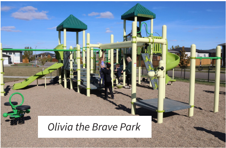
Olivia the Brave Park