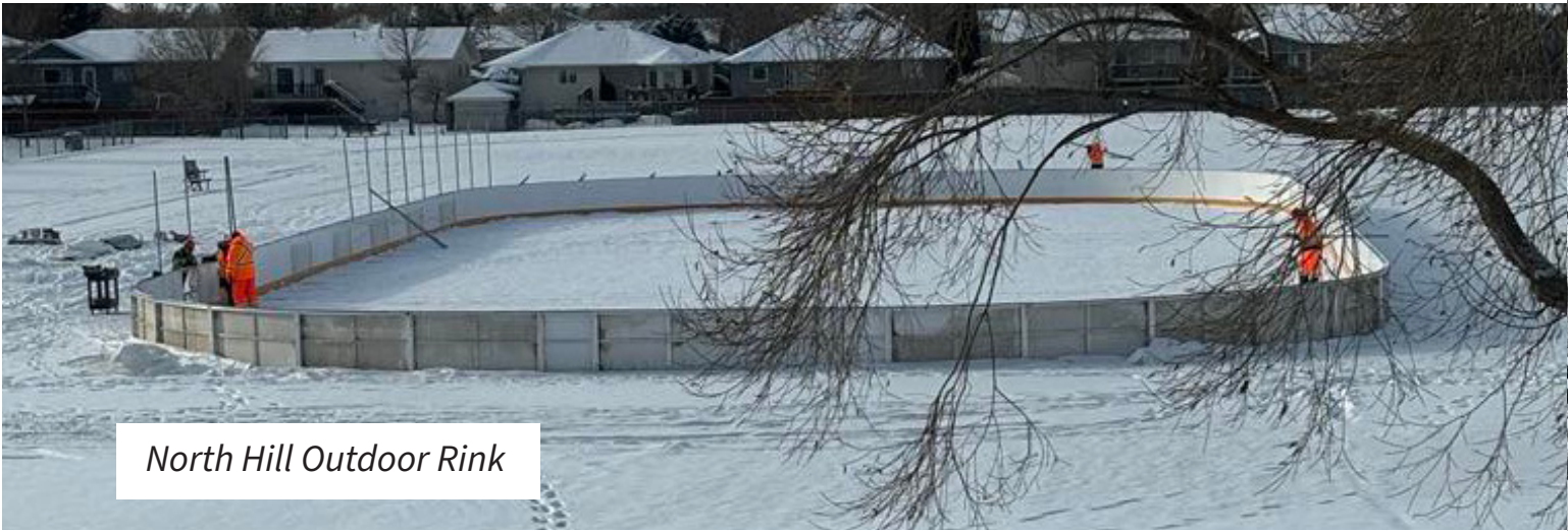
North Hill Outdoor Rink