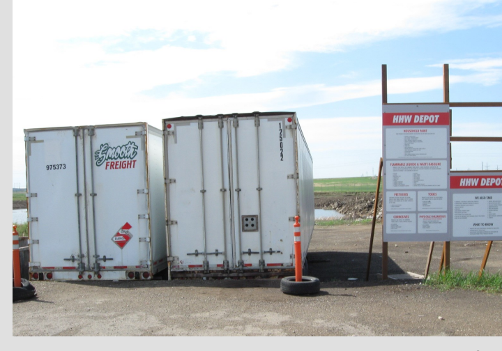
The Household Hazardous Waste Depot at the Eastview Landfill