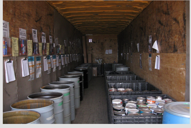
A trailer full of household hazardous waste at Eastview Landfill

In May of 2013. Brandon's Eastview Landfill became home to the first full service Household Hazardous Waste (HHW) Depot to be located outside the City of Winnipeg.